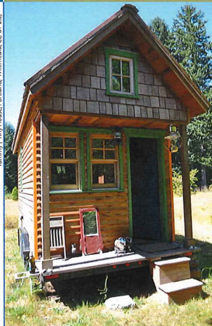
A chassis-mounted tiny house in Portland, Oregon.