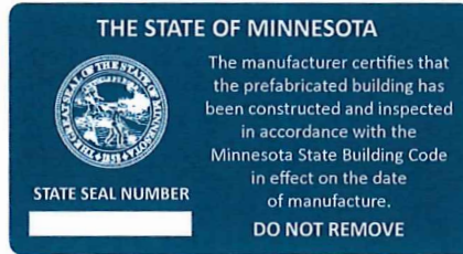
Example prefab construction label - located under kitchen sink.

Tiny houses constructed as prefabricated buildings must comply with the requirements of Minnesota Rules Chapter 1360 and be designed and constructed in accordance with the Minnesota Residential Code. Review of building plans and inspections are performed by the Minnesota Department of Labor and Industry. The completed building requires a Minnesota prefabricated building label.