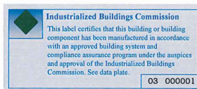
Example IIBC label - located inside each home section.

All on-site work is subject to local jurisdiction and inspections according to the Minnesota Residential Code.